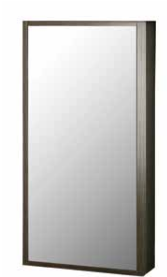
L. 6 3/8" x W. 17 3/4" x H. 31 1/2"